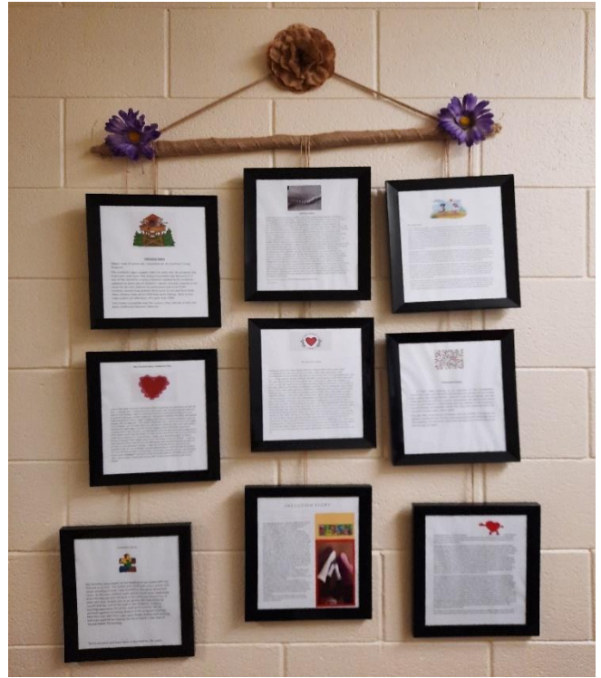
Inclusion stories written by the Hamilton East/Stoney Creek team

This year Inclusion Services staff at CLH are sharing their individual inclusion stories and we would like to invite you to do the same. National AccessAbility Week is celebrated from May 28 – June 3 and this is a time to recognize the contributions of persons with disabilities and those who support them. During this time, join us in sharing your story of your first interaction with the world of disability and how your views have changed over time. Consider your first memory with someone who had a disability and/or the people who taught you how to empathize or support them. Was there a lightbulb moment that had an impact? Tap into your inner storyteller because we would love to hear it! Submit to CLHSNR@clham.com or any CLH staff by June 3 rd to share your experience.