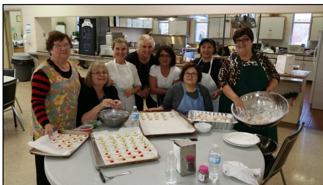
Our group of loyal bakers spent many hours preparing the baked goods table for the annual Christmas Craft Sale.

CLH held our Annual Christmas Craft Sale on Saturday November 28, 2015. Vendors were on hand with handmade crafts and baked goods. A pasta lunch was also available. We look forward to see you there next year!