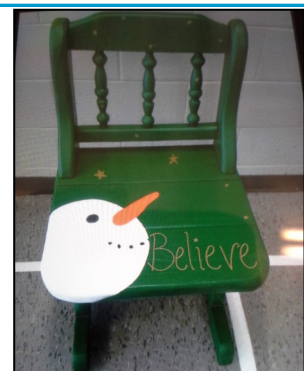
A chair made by the Hester Program was for sale.

CLH held our Annual Christmas Craft Sale on Saturday November 28, 2015. Vendors were on hand with handmade crafts and baked goods. A pasta lunch was also available. We look forward to see you there next year!