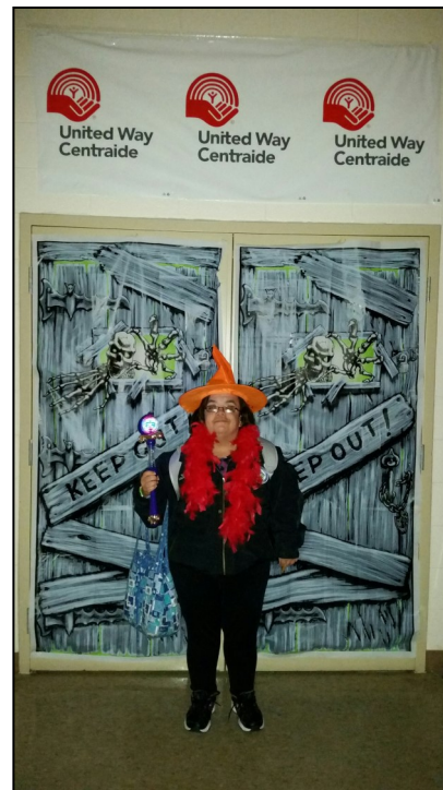
All dance guests received a light-up Halloween wand and had their photo taken in front of an ominous back drop (see above).