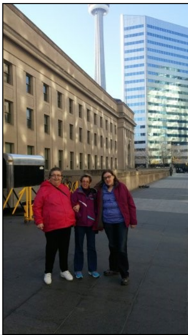
Outside Union Station in Toronto!