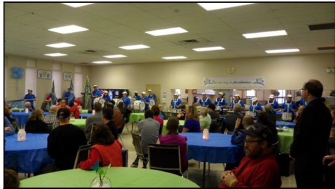
Well over 150 clients and staff attended the kick-off ceremony at 191 York Blvd.

Interviews can be a nerve-wracking experience, and therefore a special thank you goes out to all of the staff, clients, families and other stakeholders who sat down with the FOCUS Validators to talk about the great work we do here at Community Living Hamilton.