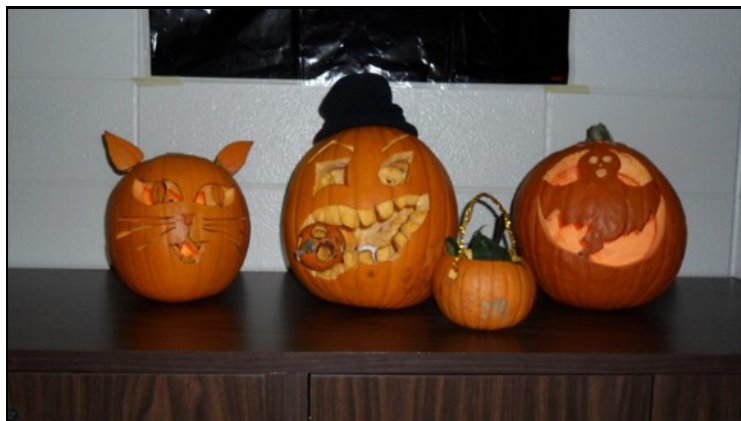
The winners from the 1st Annual Pumpkin Carving Contest!