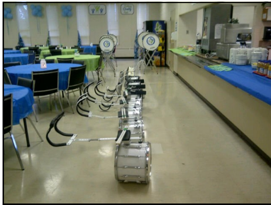
The Drum Corps was an integral part of the kick-off ceremony on November 19th.

Over 3 days, the Validators met with and interviewed: