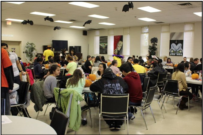
Students and Buddies display their creative side through pumpkin carving at a Meet and Greet!

Best Buddies is an organization that pairs students from McMaster to individuals with intellectual disabilities. Being involved in the program is a great way to build new friendships, learn more about one another, and remove any stigma associated with intellectual disabilities. Through our group events, and our new initiative, "Hang Out With the Execs", Buddies and students were provided the