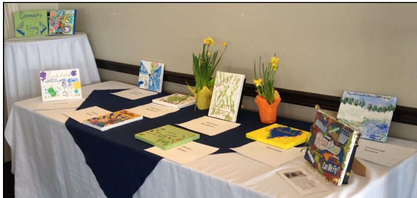
Program art work was displayed throughout the Waterfront Centre for everyone to see.