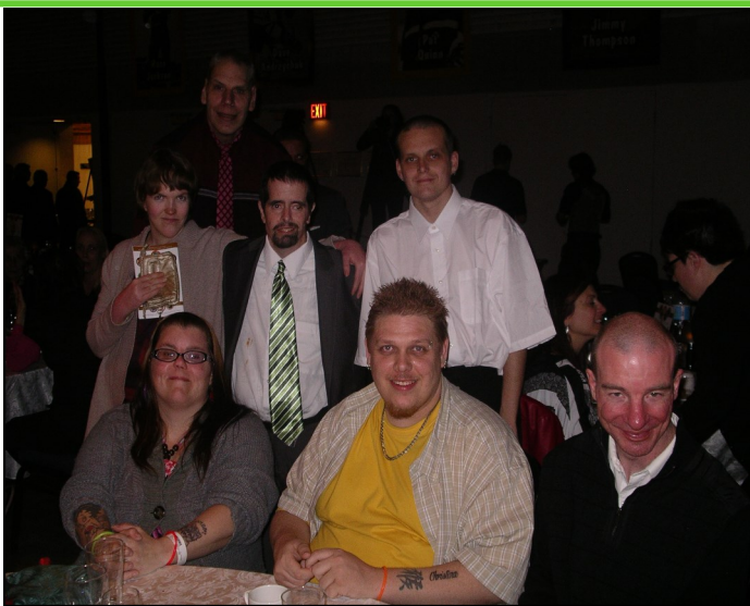
A great time was had by all The Advisors in attendance at the CYO Dinner on February 27th.

We all liked the slideshow that the CYO put on about the athletes. The speeches were great and some of them brought tears to our eyes.