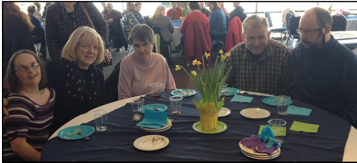
Clients and staff from Central Memorial enjoy their time at the Waterfront Centre.

Earlier in the month, programs were challenged to create a canvas that represented what it meant to them to be a part of Community Living Hamilton. The response was overwhelming and the results were inspirational. The artwork was displayed throughout the room for all to see during the event.